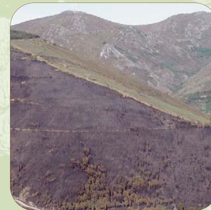
WILDFIRE STOPPED ON A FUEL BREAK RECENTLY MAINTAINED WITH PRESCRIBED BURNING