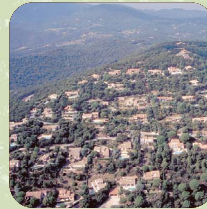
WILDLAND-URBAN INTERFACE PROBLEM IN THE FRENCH MEDITERRANEAN

A technique to expand the wildfire control capacity of firefighting operations.