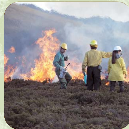
PRESCRIBED BURNING TRAINING IN A PORTUGUESE SHRUBLAND (NORTHEASTERN PORTUGAL)