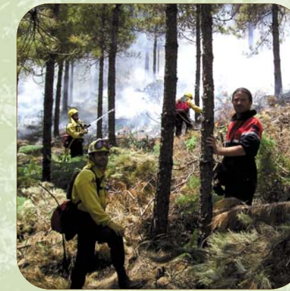
PRESCRIBED BURNING PROFESSIONAL TRAINING IN A PINE STAND (THE CANARY ISLANDS, SPAIN)