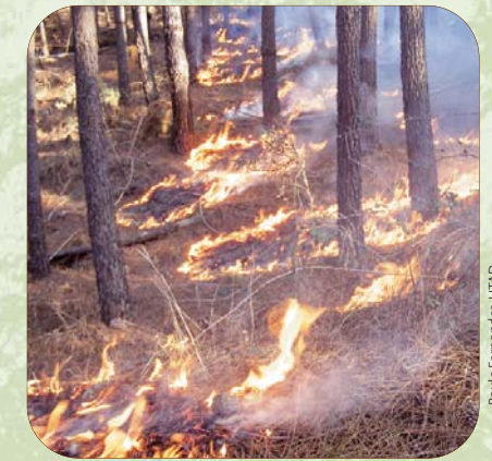
PRESCRIBED BURNING UNDER PINUS PINASTER STAND (PORTUGAL)