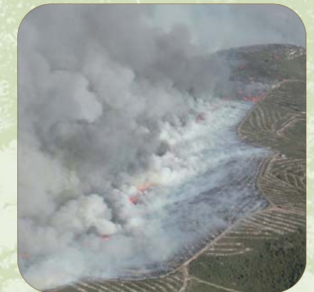
SUPPRESSION FIRE ALONG A FOREST ROAD IN CATALONIA (SPAIN)