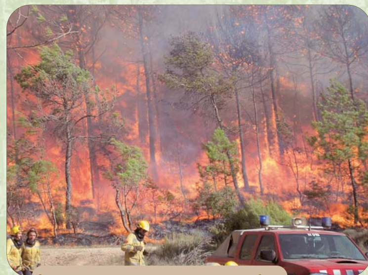
SUPPRESSION FIRE OPERATION DURING A LARGE WILDFIRE IN SPAIN